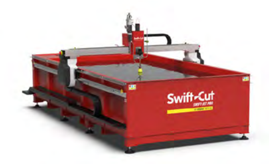
SJP 1500 (SJP 55)