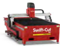
Pro 2500 (Pro 48) 2500mm x 1250mm cutting area (8' x 4')