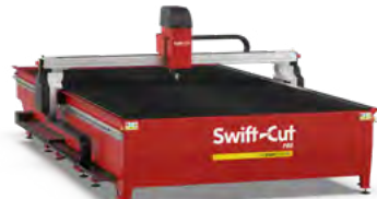
Pro 4000 (Pro 613) 4000mm x 2000mm cutting area (13' x 6.5')