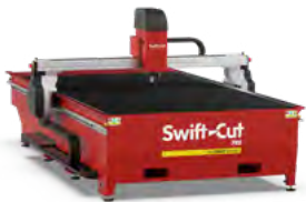
Pro 3000 (Pro 510) 3000mm x 1500mm cutting area (10' x 5')