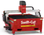
Pro 1250 (Pro 44) 1250mm x 1250mm cutting area (4' x 4')

The Swift-Cut Pro has been designed by our skilled team of engineers to provide an all-encompassing plasma cutting solution with industry leading features as standard and is available in 4 sizes.