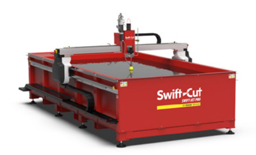
SJP 1500 (SJP 55)