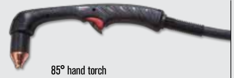
85° hand torch

Duramax Hyamp standard torch styles (for more torch options, see www.hypertherm.com )